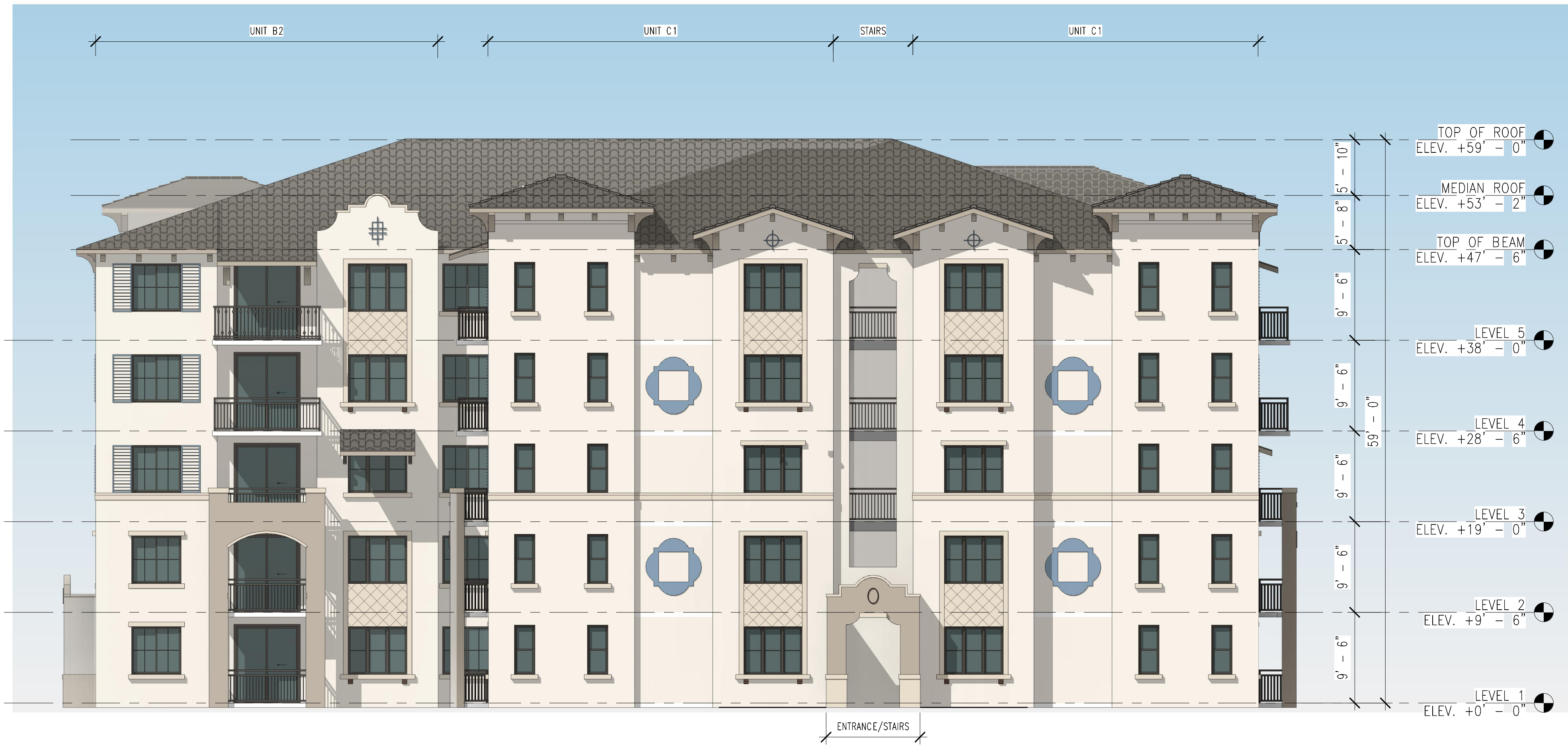
4 SIDE ELEVATION 1/8" = 1'-0"