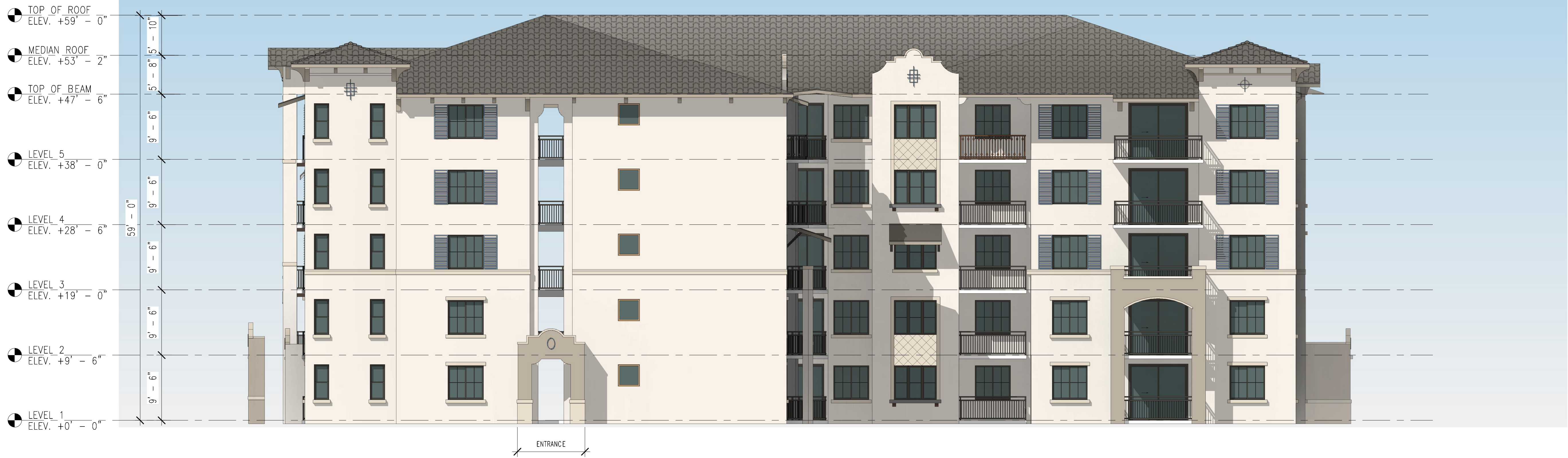
3 BACK ELEVATION 1/8" = 1'-0"